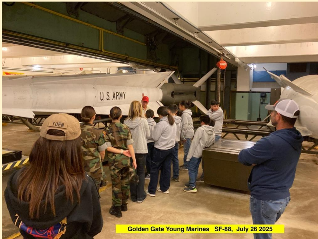
Golden Gate Young Marines SF-88, July 26 2025