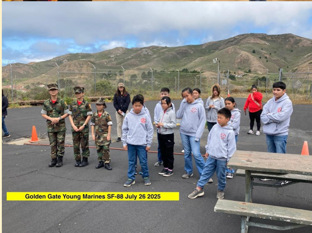
Golden Gate Young Marines SF-88 July 26 2025