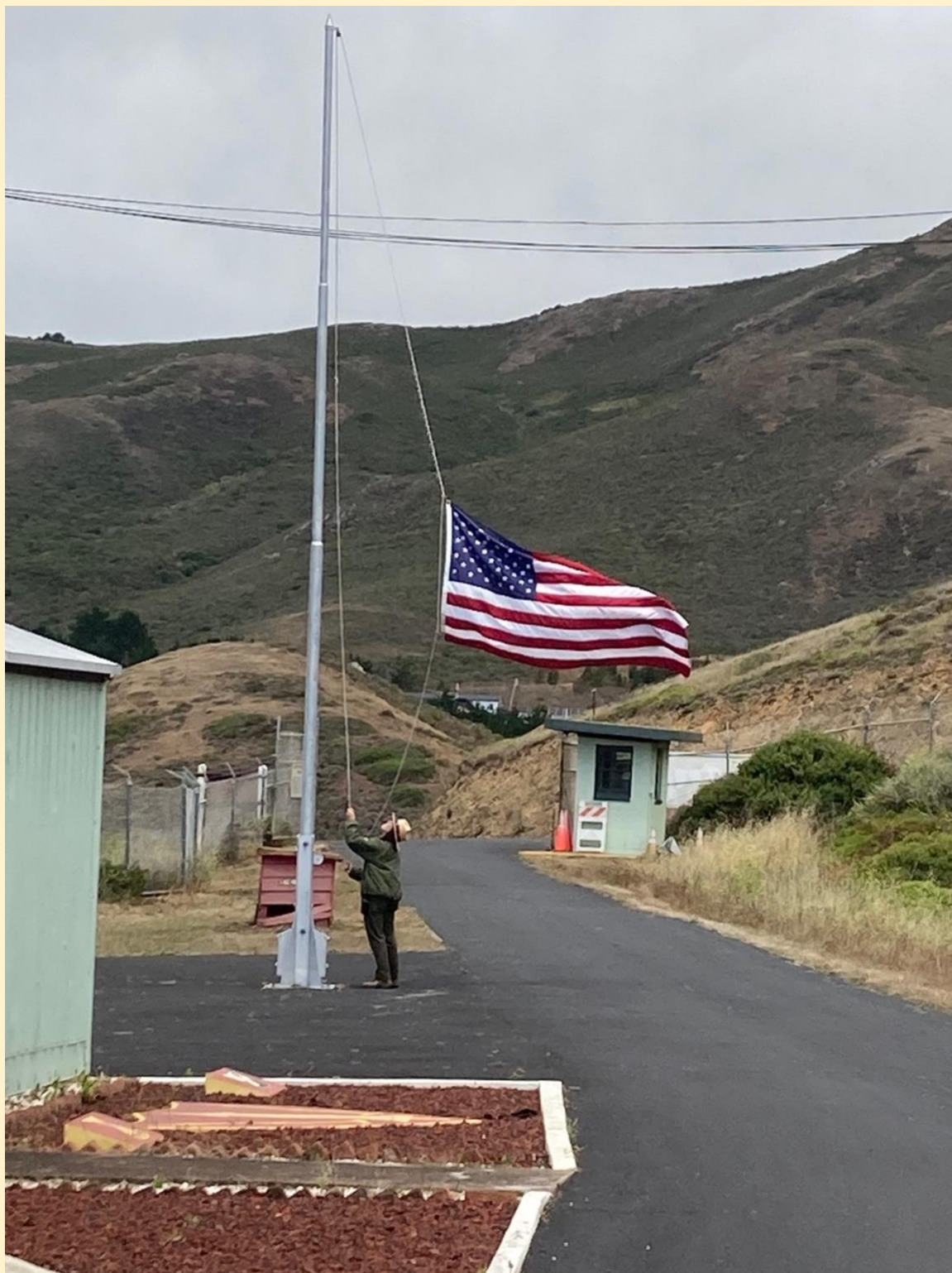
Ranger Vassar Terry raising the flag at Saturday open house