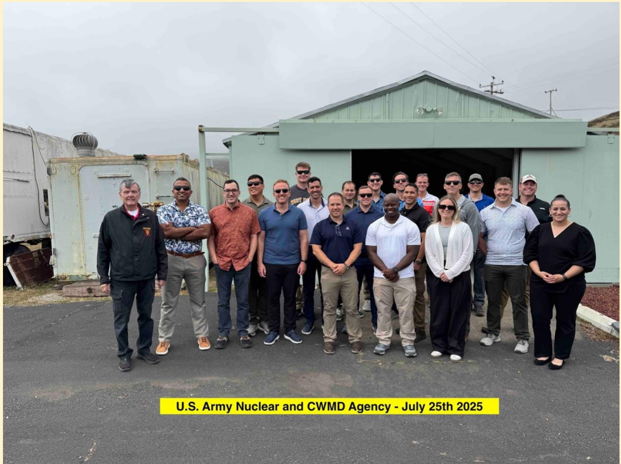
U.S. Army Nuclear and CWMD Agency - July 25th 2025